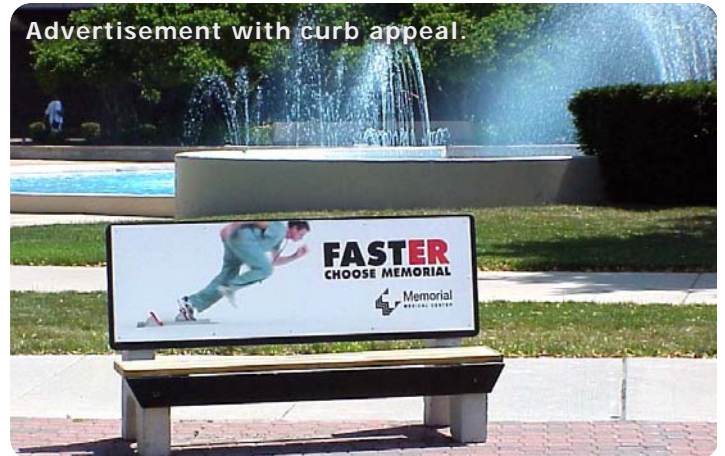
Advertisement with curb appeal.

This chart illustrates the cost per 1,000 impressions